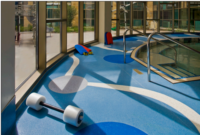
Complex flooring designs highlight every area of the hospital. Above, colorful designs in the children's physical therapy center achieve a happy, energetic tone. Below, colorful numbers in the flooring near elevators act as wayfinding tools. At bottom, rubber tiles were installed with heat-welded seams in the rehab pool area.

In the administrative areas, raised access flooring was installed with underfloor air delivery for more efficient air circulation that requires less power than traditional systems. "Intertech has provided raised flooring since 1991, integrating an underfloor plenum or chase for electrical, voice/data and air supply creating significantly less expensive and quicker moves for high churn facilities," said Imhoff. "We have also cross-trained our installation crews to provide installation services for all floor covering and raised flooring applications. This provides for a smoother construction and renovation process for our customers."